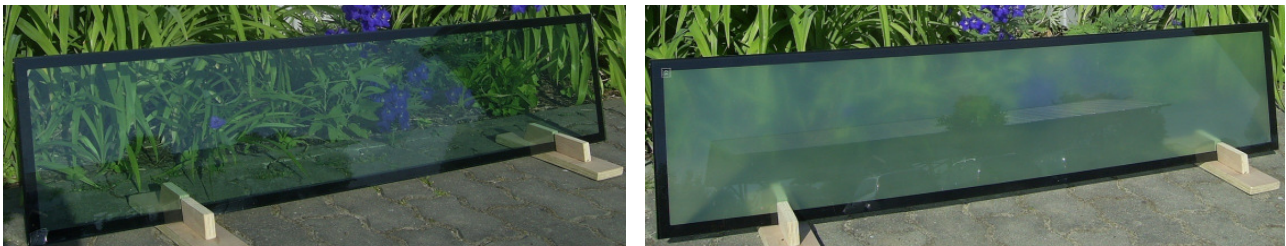
Fig.1: Self-regulating sun protection glazing, left: 25 °C, right: 37 °C surface temperature.

In addition, SOLARDIM®-ECO decreases glare and eye discomfort, harmful UV rays of the sun are absorbed.